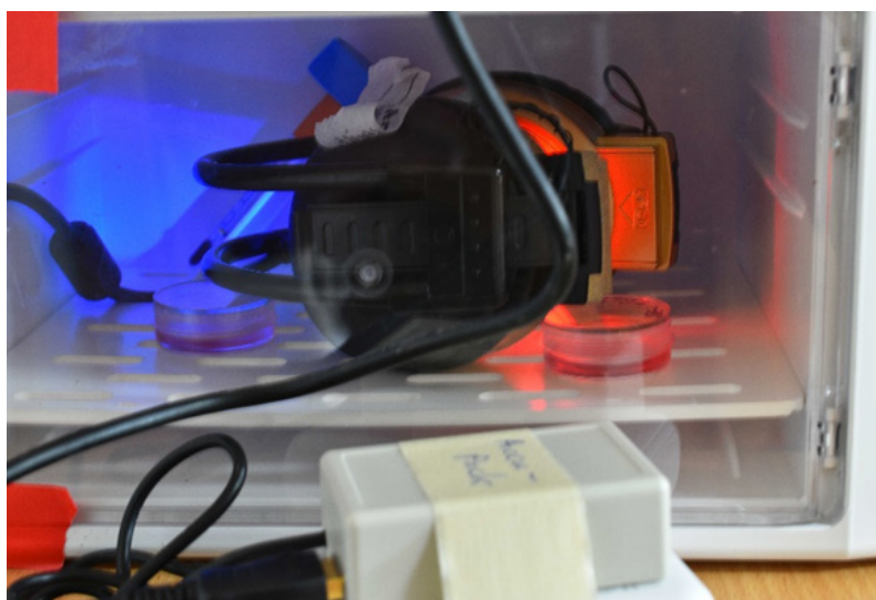
Figure 1. An open mini-incubator can be seen, in which two cell dish dishes are placed underneath, which are very close to the back left with a Sferics alternating field emitter headphone [8] (transmitter/fair-weather field emitter verified via the bracket) acts on the cell lines (blue color); red color front-right you can see another cell dish. In front of the incubator, slightly hidden, is a battery pack (box below) with an AC sieve device, partly realized according to and fixed/glued on top for the direct current supply of the headphone Sferics emitter electronics.

The intestinal epithelium, which is only one cell layer thick, has two essential tasks. The first is to create a physical barrier between the contents of the intestinal lumen and the rest of our body. The second is to ensure an efficient absorption of essential nutrients from the gut lumen and to produce mucus, anti-micro-